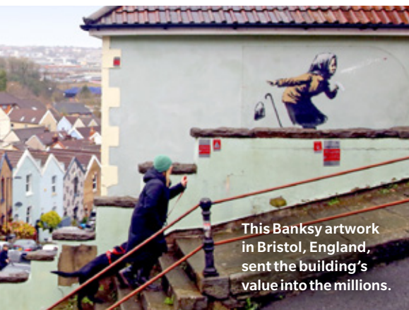
This Banksy artwork in Bristol, England, sent the building’s value into the millions.

After studying architecture, Millo (Francesco Camillo Giorgino) became disenchanted by its bureaucracy and limitations. While looking for a new direction 11 years ago he was asked to paint a wall in the village of Montone for an arts festival.